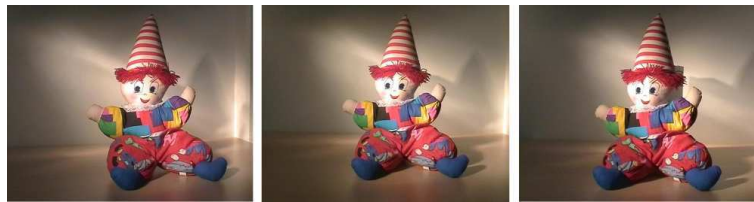
Figure 2: Three input calibrated images.

We have presented in this article an adaptation of an image-based method using a small set of input images whereas other methods require a large set. The final image is quite realistic compare to the real model. Moreover, since the computation of an image does not depend on the previous generated images, our method allows the rendering of dynamic scenes for a low resolution final image. This method can be implemented for every consumer graphic hardware that supports fragment shaders and therefore frees the CPU for other tasks. Since our scoring method takes into account all input images together and reject outliers, our method handle occlusions. Finally, our scoring method enhances robustness and implies fewer constraints on the position of the virtual camera, i.e. it does not need to lie between the input camera's area. We propose to extend our research on a stereoscopic adaptation of our method that compute the second view for low cost.