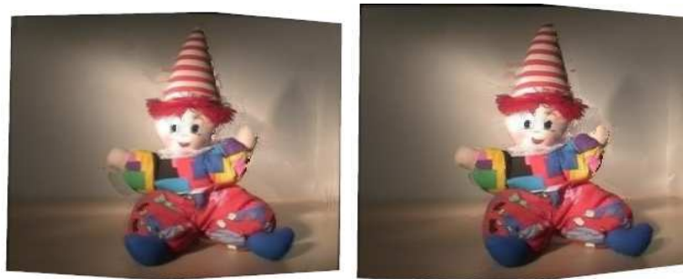
Figure 3: Two real-time images from three input cameras (20 fps with 30 planes).