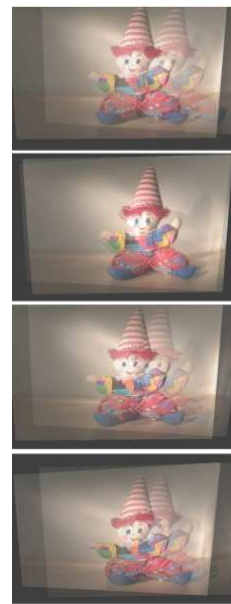
(b) Four pictures associated to four steps of the algorithm using two input cameras.